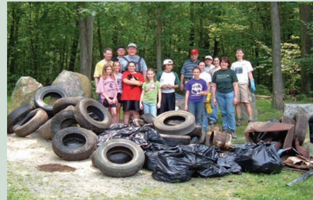
2006 Wanaque River clean up

Unlike the national environmental groups, Skylands CLEAN is right in your neighborhood, preserving our local communities' natural beauty and quality of life. We are largely made up of volunteers - your neighbors - who believe as you do that the beauty, wildlife, and critical natural resources we enjoy here in the Highlands need to be protected.