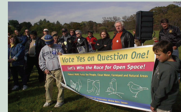
Open space rally, Ringwood State Park 2003

Your contributions are key to our success!