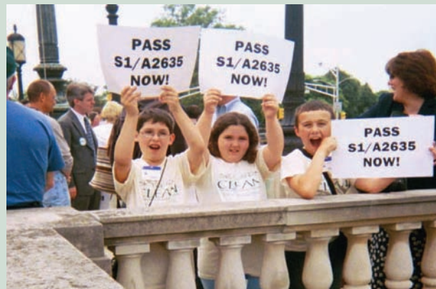
Young activists join CLEAN at a Highlands Bill rally in 2004.