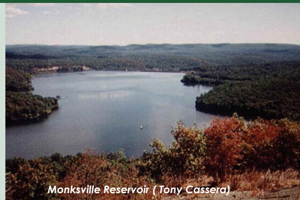
Monksville Reservoir